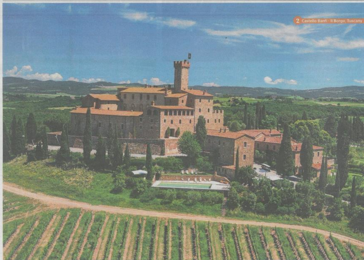
2 Castello Banfi - Il Borgo, Tuscany

Page 28 'The sea was an almost fluorescent turquoise, lapping against white beaches' Hannah Fletcher on Florida's secret islands