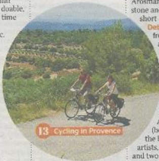
13 Cycling in Provence