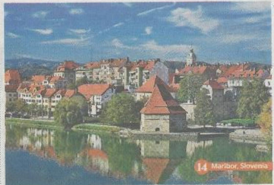
14 Maribor, Slovenia

For the whole of October and into November, the Slovenian city of Maribor