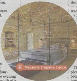
6 Masseria Trapana, Lecce

Details Four-night breaks run on selected dates from the end of September and cost from £1,225pp.