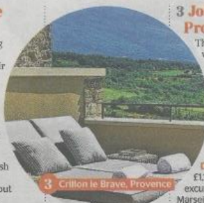
3 Crillon le Brave, Provence

Details B&B rooms are from about £590; cooking lessons are £212 ( castellobanfililborgo.com )