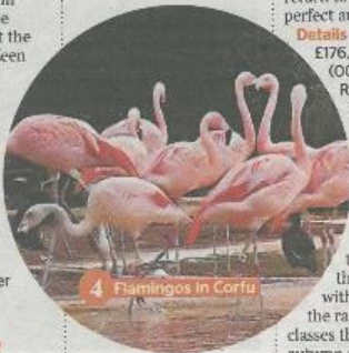
4 Flamingos in Corfu

Autumn in Menorca brings temperatures touching 26C and often deserted sandy beaches; the island is just right for a chilled out (but warm) visit in September. The place to stay for pampering without breaking the bank is Barcelo Hamilton Menorca, a chic four-star hotel (for adults only) close to the entrance of the port of Mahon. There are two pools, a spa with a Finnish sauna and massage treatments and a rooftop bar with hot tubs for sunset cocktails. Details B&B doubles are from £80 a night (barcelohamiltonmenorca.com)