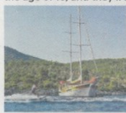
Negombo Beach, Sri Lanka