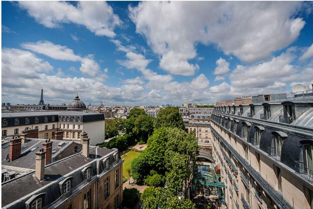
— The Ritz Paris

Since 2012, The Ritz Paris has been closed for refurbishment and restoration. The iconic hotel in Place Vendôme has been sadly missed, but the wait is finally over. In March 2016, the hotel is set to reopen its lavish doors, with eagerly awaited improvements. Added is a new shopping gallery with the likes of Chanel, Prada and Cartier, a tunnel under Place Vendôme, for the most discreet of guests, and a serene new spa. Opening from 14 March 2016.