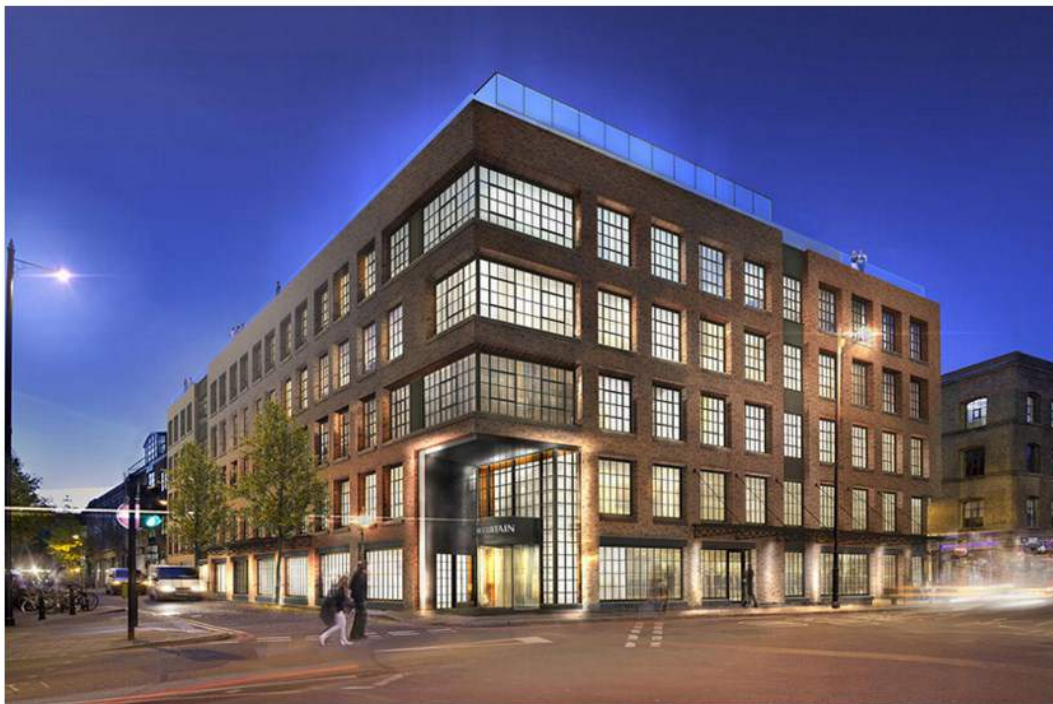
— Curtain Hotel