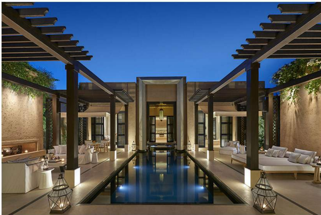
— Mandarin Pool Villa Marrakech