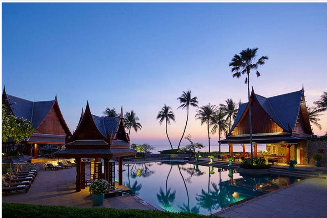
— Chiva Som Thailand