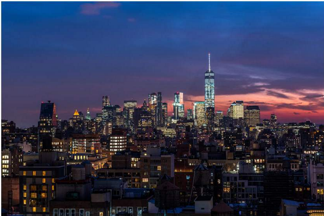
— INNSIDE New York NoMad

In March, Melia Hotels International is launching its first New York hotel. 'INNSIDE New York NoMad' (weird name, we feel) can be found in the heart of Manhattan, with views of the Empire State Building and the city's famous skyline. The hotel is the first of its brand in the United States, continuing the stylish and sophisticated aesthetic the brand is known for. From $249 per night.