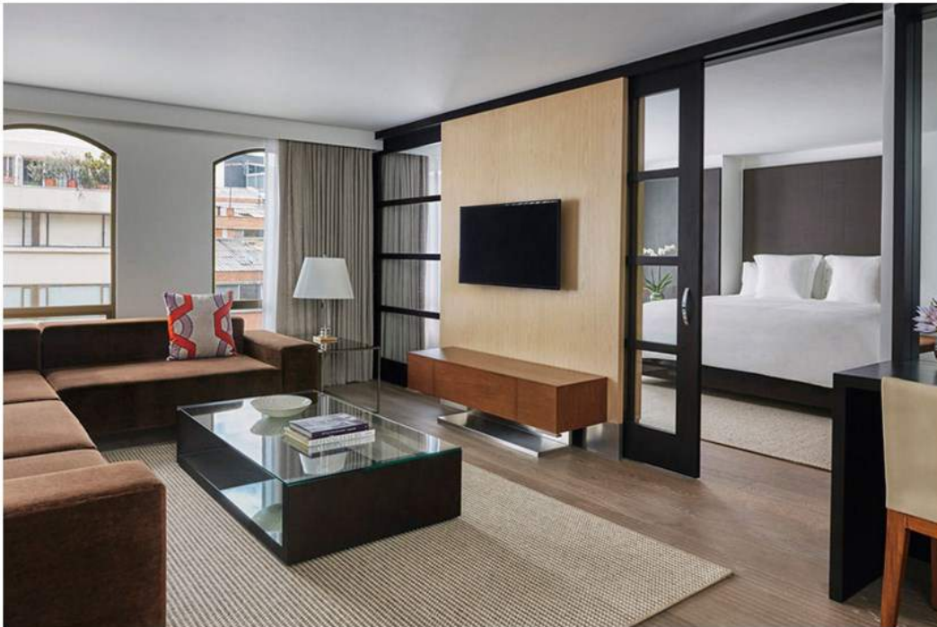
— Four Seasons Bogota

According to The Sunday Times Magazine , 'the new capital of cool' is the south american city of Bogota. The Four Seasons is opening a new hotel in Bogota in April, which, we feel, confirms this. The place is set to be as luxurious as you would assume – but with a more contemporary flare. Opening April 2016.