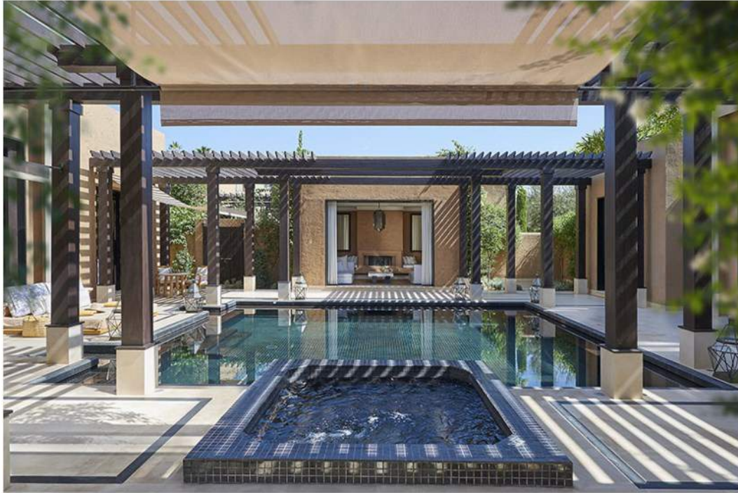
— Mandarin Oriental Marrakech- Oriental Villa

With the Atlas mountains in the background, the Mandarin Oriental's new hotel in Marrakech is as much about views outside as the niceties within. Comprised of 62 villas and suites, each of which has a heated pool, juczzi and open air shower within a personal walled garden, luxury and privacy abound. The interiors are glamorous with hints of Moroccan textiles. Well worth a visit. Suites from about £530.