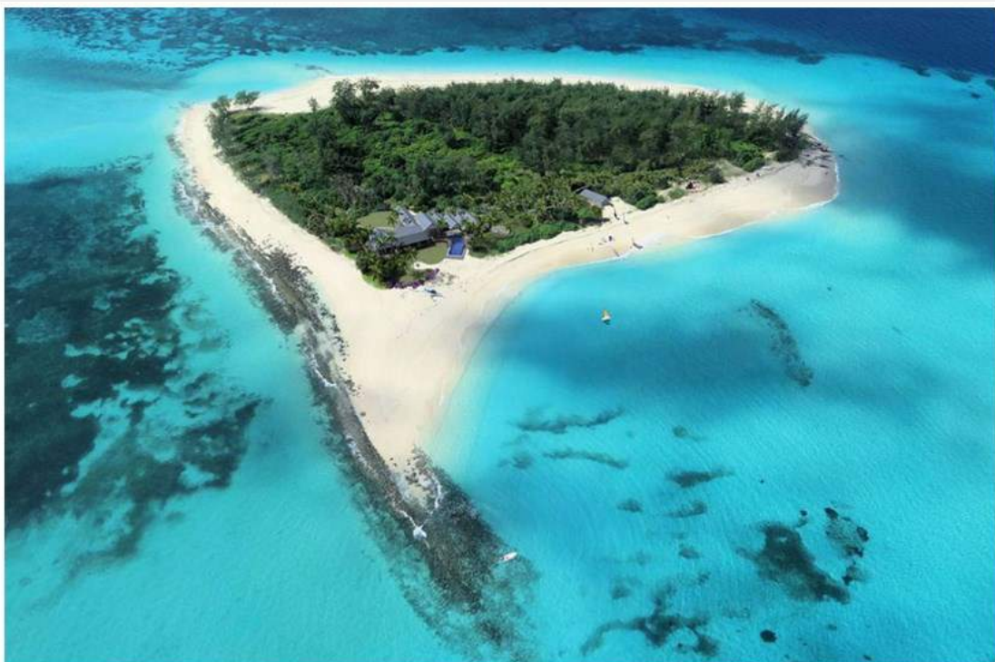
— Thanda Island