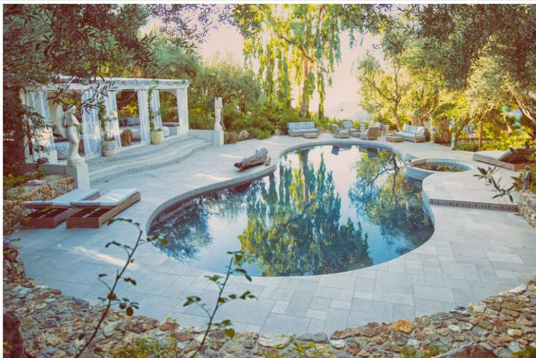
— Aja Malibu