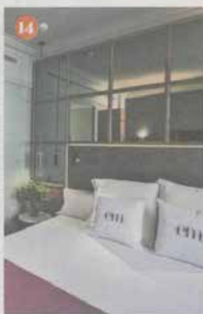
14 Details Cabins cost from £650 a night (ugaescapes.com/chenahuts)

Chena Huts has recently opened as the latest Uga Escape, a growing group of chic hotels in Sri Lanka. It's set in jungle by a beach near Tissamaharama, convenient for Yala National Park. There are 14 romantic wooden cabins with palm-frond roofs, giant beds and a "posh log cabin" look. Each also comes with a private plunge pool on a deck.